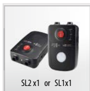
Ⓑ Power Pack