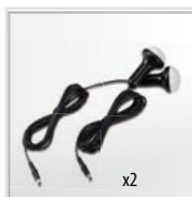
Ⓒ LED Bulb